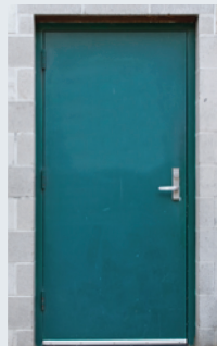
» Hollow Metal